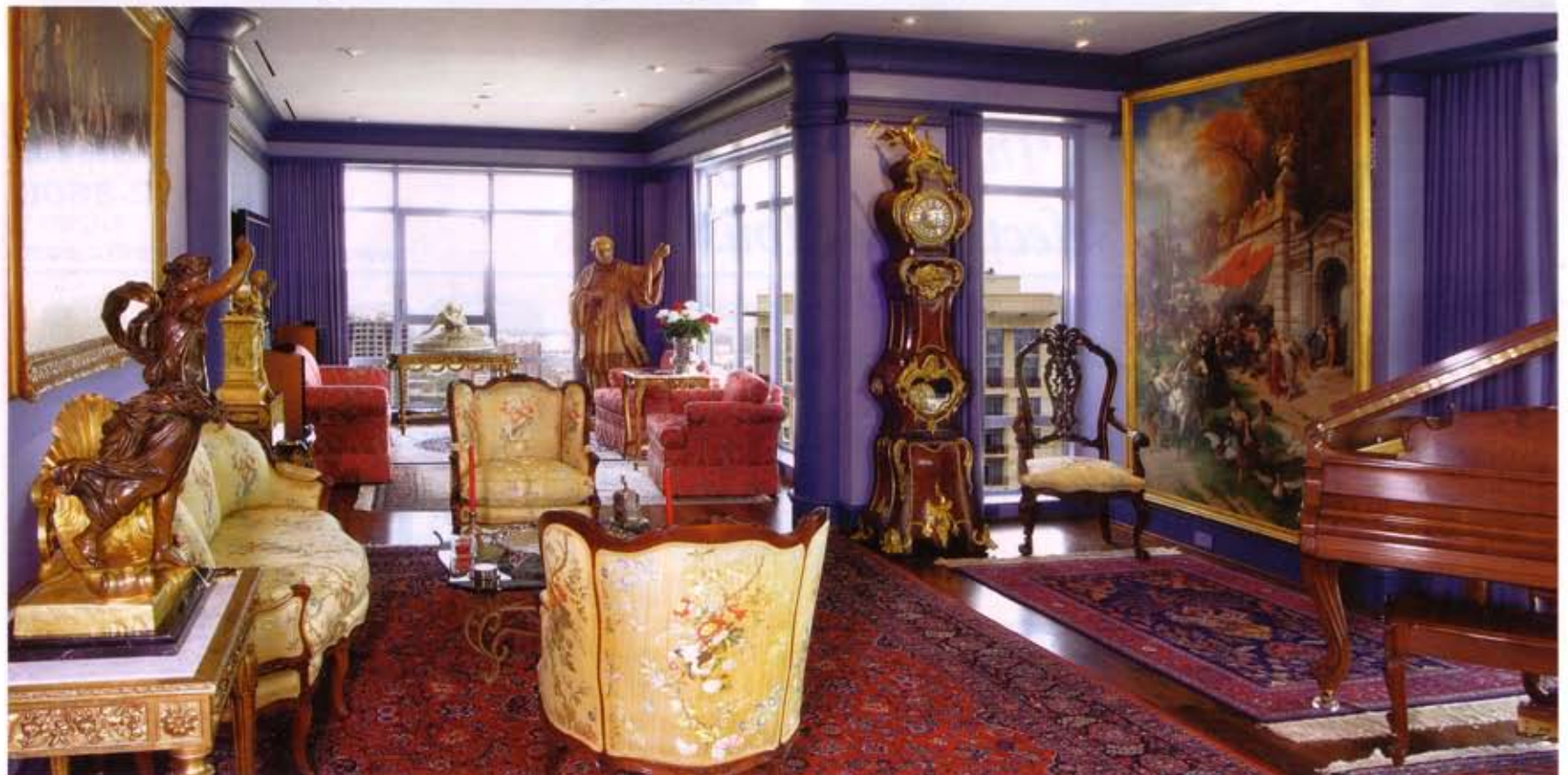
Classic European antiques and art coupled with fine Persian rugs bring a formal tone to the living room of the high-rise condominium. Generous windows offer views of the Uptown Park area.