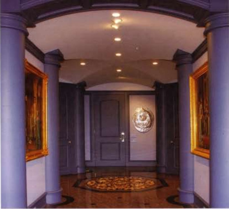
Take in a view of the foyer, with its groin-vaulted ceiling, from the living room. ICM Marble & Granite crafted the stone around the inlaid marble in the floor; master craftsman Candalerio Zelaya fit together the various pieces of stone.