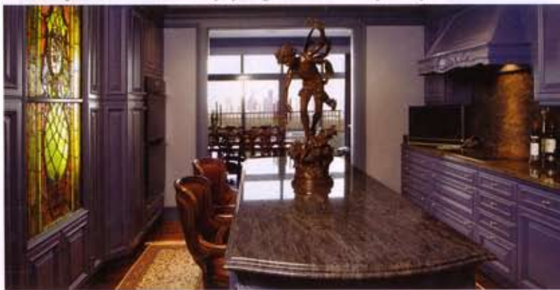
ICM Marble & Granite installed Visage Blue Granite in the kitchen to complement the shade of blue the couple chose for walls and woodwork throughout the apartment. The 19th-century stained-glass window from England had been in storage for years; the couple had it installed and backlit to bring cheerful light into the kitchen.

BY DONNA TENANT