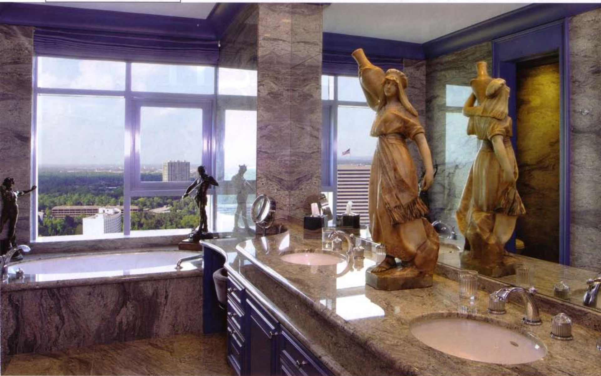
The master bath is a masterpiece of White Piracema Granite, which covers walls, tub surround, shower walls and countertops. Eighteen slabs of the granite, installed by ICM Marble & Granite, were required for the bath and master bedroom.