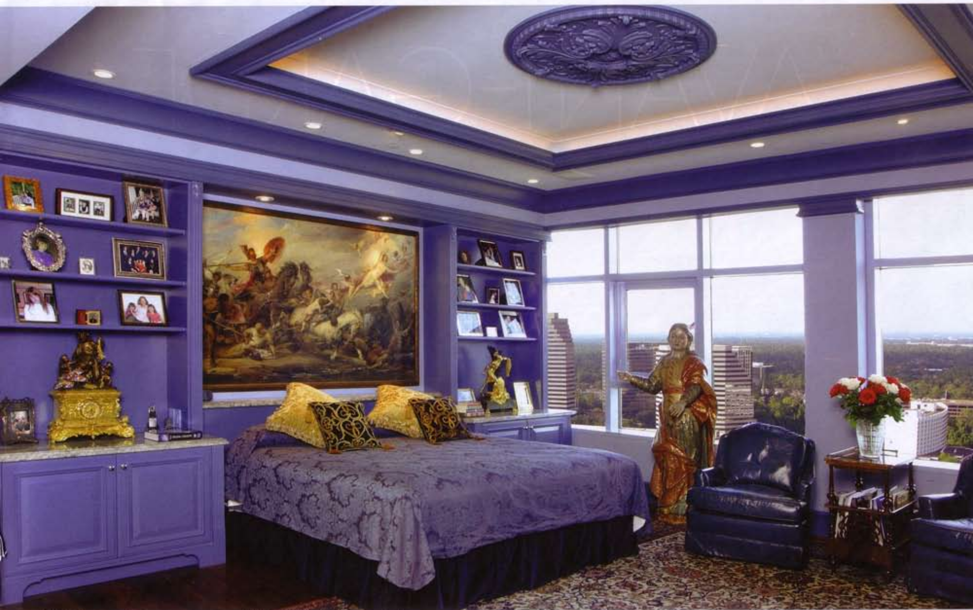
White Piracema Granite covers countertops of the bookshelves in the master bedroom.

painting, sculpture and piece of furniture was going," says Levy, "so we planned the molding accordingly." Master trim carpenter Dave Penna measured, fabricated and installed it. Penna also built the lighted cabinet for the stained-glass window in the kitchen.