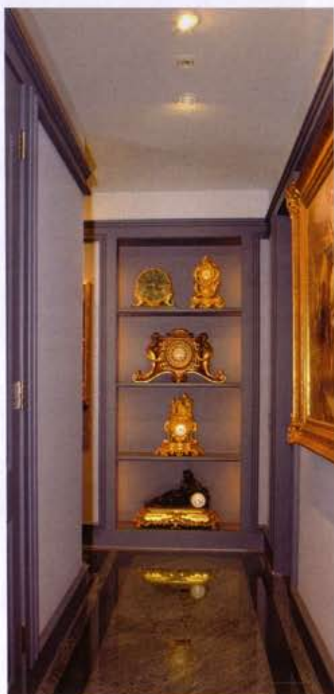
A collection of fine antique clocks is reflected in the Visage Blue Granite floor of a hallway.

The finishing touch in this room is the crown molding, which was designed to highlight the paintings, some of which are 8 feet tall. "The owners knew where every